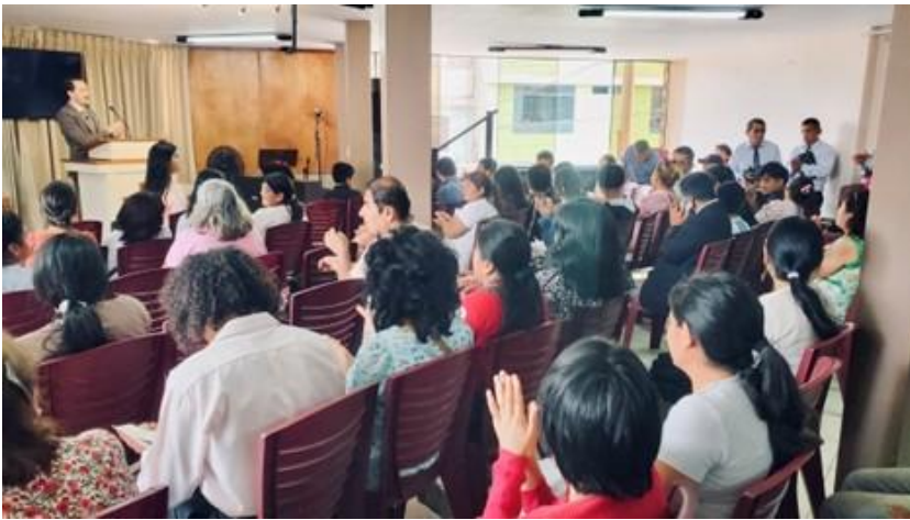
We had a great day on Easter Sunday!