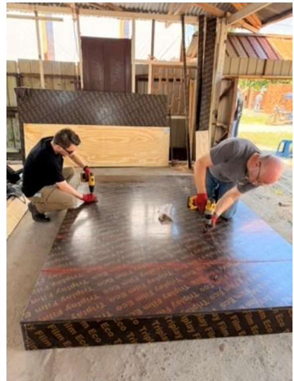
My dad and I made the new platform for the church in Pucallpa.