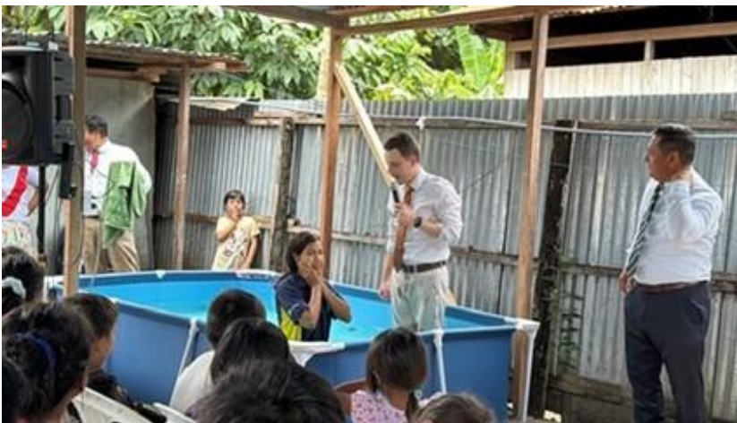
I am baptizing a new convert in Pucallpa.